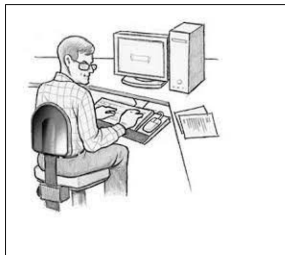
Figure 1: Diagram showing the incorrect way to sit during DSE use; adopted from a guide to computing by (CHRISTOPHER BARNATT, 2012)